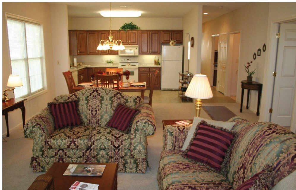
Interior photo of a Crystal Ridge home.

Have you toured our beautiful campus or received information about our independent living homes? Perhaps you've been thinking about moving here for a while and are waiting for the right time. We have eight good reasons for you to consider a move!